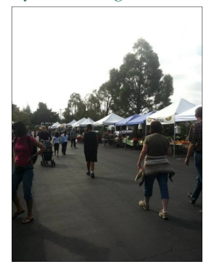
munity Park, San Jose City College, Redwood Shores, and Foster City. The group rents the parking lot from the college.

It currently operates a weekly farmers market in Cupertino and will soon open locations at Brisbane Com-